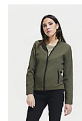
SOL'S RACE WOMEN 01194